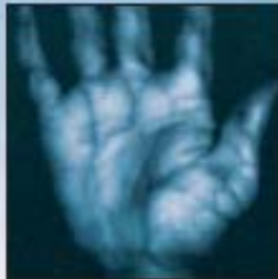
Generating near-infrared image