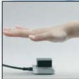
Contactless detection of hand vein patterns