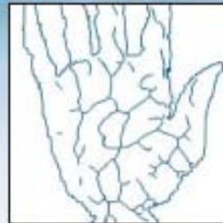
Conversion of image data for encrypted database archiving