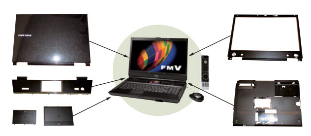
The FMV-BIBLO NW90C, which utilizes plant-based plastic

Fujitsu will continue to develop versatile plant-based plastics applicable to a wide range of products and promote their more extensive use in electronic equipment. It will also pursue the use of non-food raw materials that do not compete with food crops