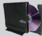
External USB Super Multi DVD Writer