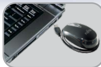
USB Optical Scroll Mouse