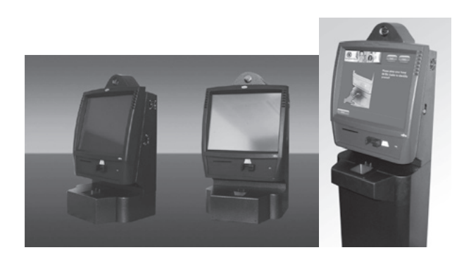
Figure 1 Med-Serv 50/60 Patient Kiosk.

As shown in Figure 2 , the kiosk's PalmSecure palm-vein sensor, which can also be implemented in other hardware configurations, allows a patient to sign in at the healthcare