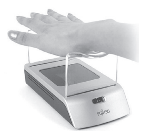
Figure 4 Sensor unit for PalmSecure biometric authentication.