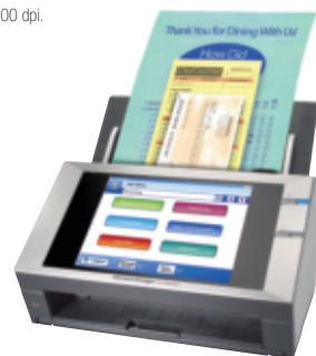
ScanSnap N1800 Network Scanner