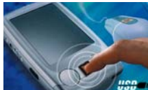
Computer peripherals and physical access systems