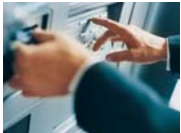
ATM's and kiosks

The Fujitsu palm vein sensors are best for high-security, multi-user applications such as ATM's and kiosks, door lock and integrated building security systems and other security systems where throughput, low false-rejection rate and improved forgery protection are important.