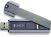
USB flash drives