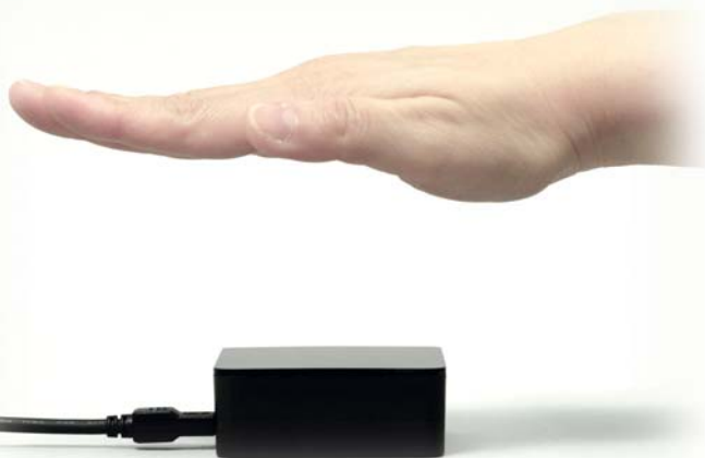
Palm vein authentication systems