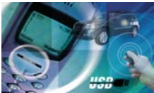
Mobile access applications

The Fujitsu fingerprint sensors are best for devices such as cell phones, USB flash drives, notebook computers and other applications where price, size, cost and low power are key requirements.