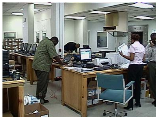
Staging and Integration Facilities

Whether it is the convenient door-to-door delivery of multi-vendor IT hardware and software assets at competitive prices or the complete life cycle management of Client based IT assets in remote locations - Fujitsu is able to provide a full range of selectable services that are easily understood, clearly defined and rich in added value.