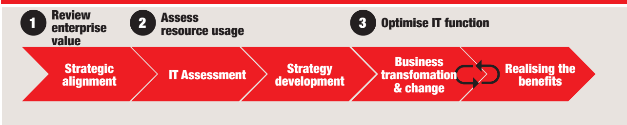
FIGURE 3 FUJITSU FRAMEWORK FOR ALIGNING IT

Fujitsu Australia and New Zealand is a leading service provider of business, information technology and communications solutions. Throughout Australia and New Zealand we partner with our customers to consult, design, build, operate and support business solutions. From strategic consulting to application and infrastructure solutions and services, Fujitsu Australia and New Zealand have earned a reputation as the supplier of choice for leading corporate and government organisations.