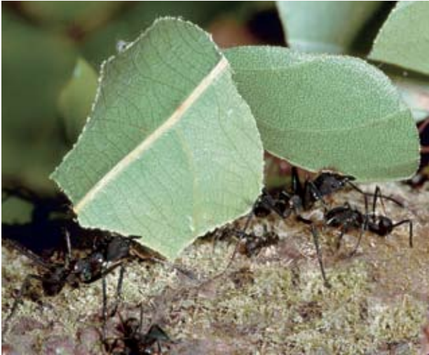
FAST TRACK WITH JOBSHARING

FlexFrame’s modular architecture replaces rigid hardware and software configurations with virtual bridges. Computing power, storage resources, network components and mySAP ERP solutions can all be independently scaled and assigned dynamically. The result is a highly adaptable infrastructure that responds to changing business process needs in real time. All strategic IT resources are available on demand, giving you greater enterprise-wide agility. Let’s face it, flexibility is everything in a world where business processes are evolving at lightning speed.