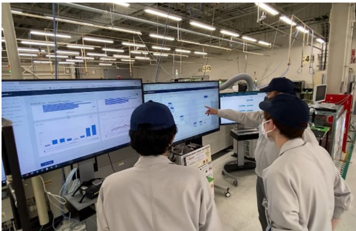
FiNET KAIZEN experts using SAP Signavio during the Digital KAIZEN trial phase

Fujitsu i-Network Systems (FiNET), with its plant in Yamanashi prefecture in Japan, has a legacy of more than 8 decades of manufacturing. Currently, the company is engaged in the production of Printed Circuit Boards (PCBs) among other networking equipment. In line with its tradition of KAIZEN and innovation, FiNET agreed to be a participant in a trial for Digital KAIZEN. The factory has been at the forefront of innovation and has applied technologies such as IoT, AI, OT security on the shop floor. Most of these technological initiatives were, however, carried out over a span of time with limited objectives, e.g., tracking the movement of lots, machine data collection, or operator productivity. So, while a lot of data was collected and analyzed, it wasn't tied up in a single thread of the end-to-end manufacturing process. SAP Signavio was leveraged to bind these different data sets together. After careful analysis, and to the surprise of the participants, Digital KAIZEN uncovered a 'hidden shop floor'.