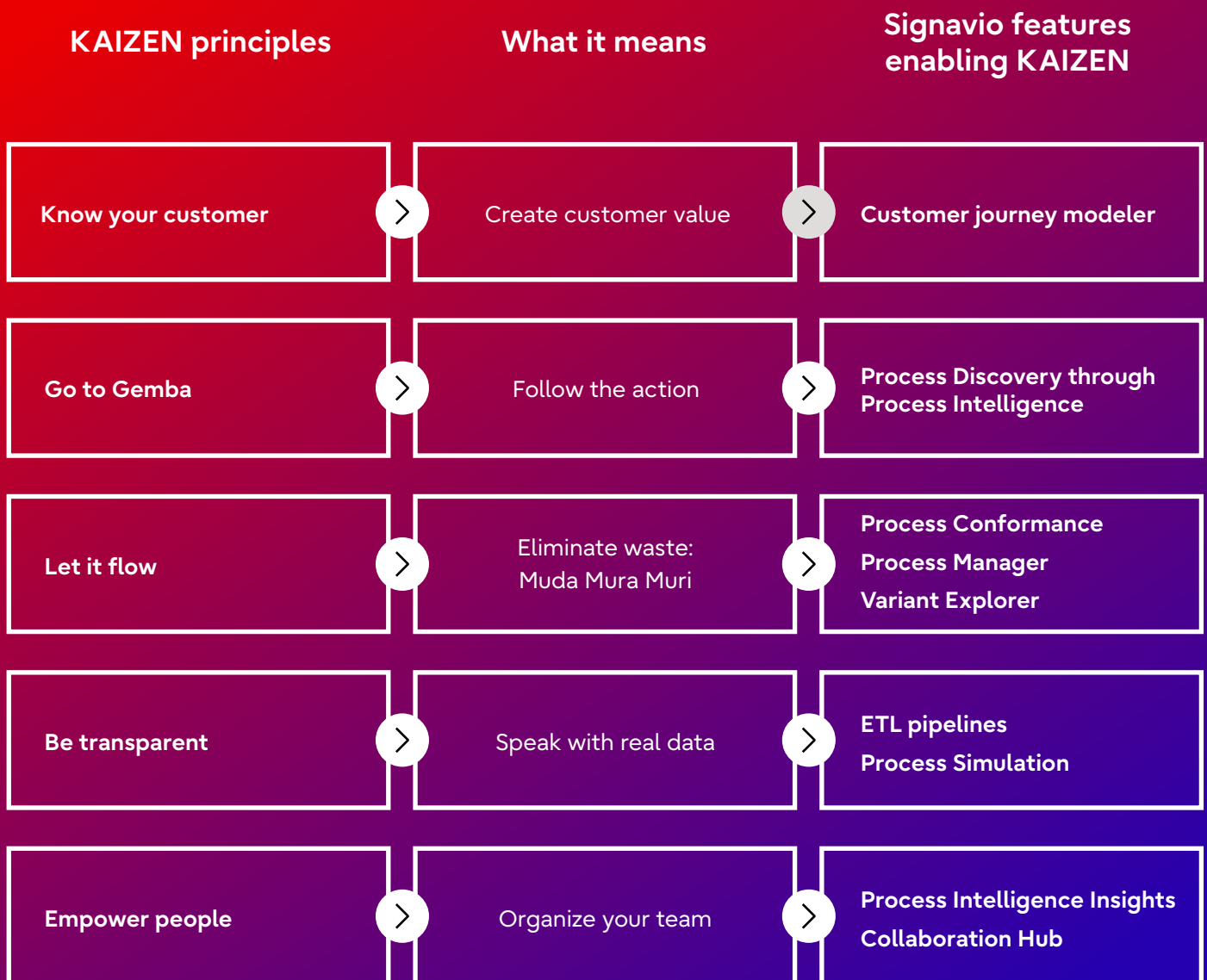
Digital KAIZEN powered by SAP Signavio

The image below illustrates how Digital KAIZEN can be powered by SAP Signavio product features.