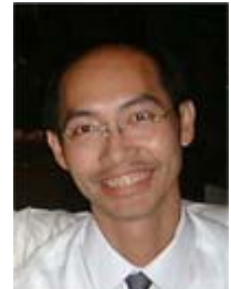
Associate VP of Corporate Strategy & Management Office, Fujitsu Semiconductor Pacific Asia

Spurred by the 12 th Five-Year plan, China's semiconductor industry has been flourishing with a bewildering array of new technologies and exchange activities emerging. In the wave of development, Fujitsu Semiconductor continues to introduce new technologies and products that meet the development requirements of the times and actively explores new business areas. By promoting cooperation among academia, industry and research through expanded contacts with China's universities, Fujitsu Semiconductor keeps China's semiconductor industry supplied with impetus and support and has overwhelmingly become the backbone ... More