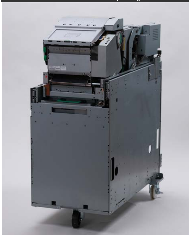
G750 Multi-Cassette Recycling Module